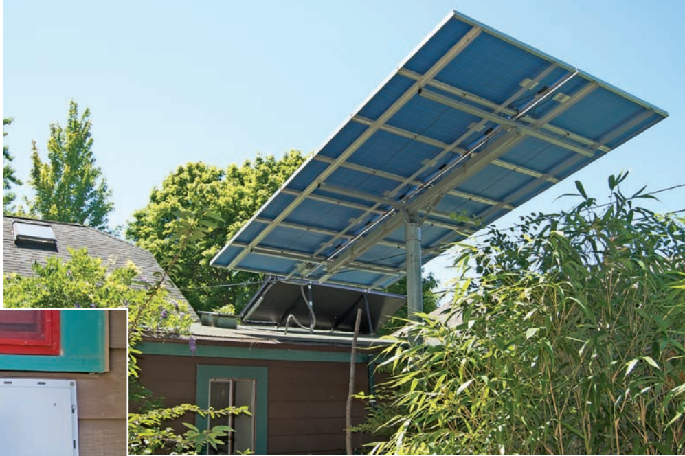
Shawn Schmeier (3)

Six months of the year, the home's PV system produces more energy than its inhabitants use. During the winter months, the system offsets about 30% of the five residents' usage.