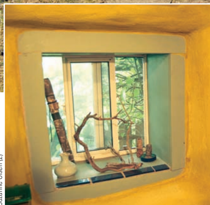
Suzanne Olsen (2)

Tucked into the corner of the yard, the straw bale studio make a cozy office/living space.