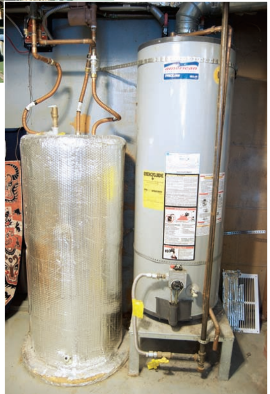
Shawn Schreiner (2)

She used many of the projects to provide her students with hands-on instruction and often invited people in the community to participate. Her home is a favorite on several home tours in the area—including last year's Build it Green! Tour of Homes, where a record number of people turned out to admire their work. Here are a few of the applications that had the crowds stretching on their tiptoes for a second look.