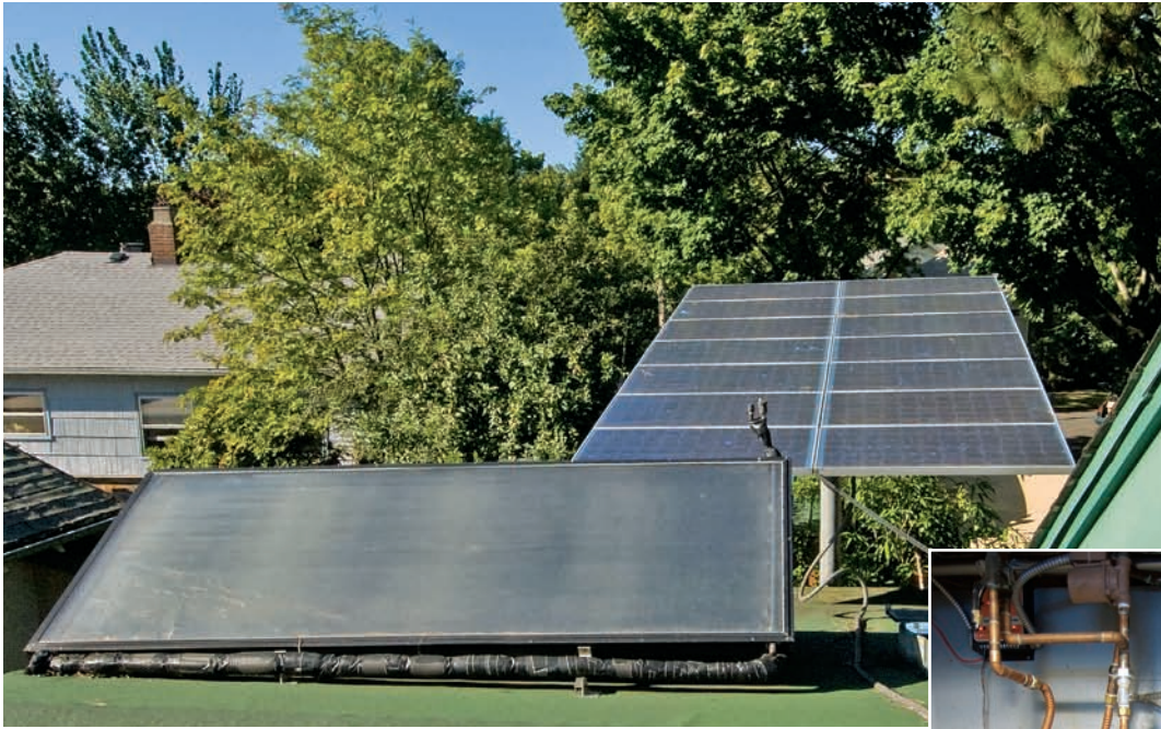
Left: A 4- by 10-foot solar hot water collector and a 1,540-watt PV array provide heat and power to the home.