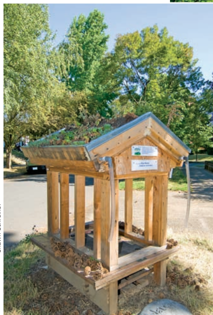
A model of a living roof serves as a neighborhood education tool.

Recycled and salvaged materials, as well as renewable energy technologies, come together to create an efficient and comfortable urban oasis.